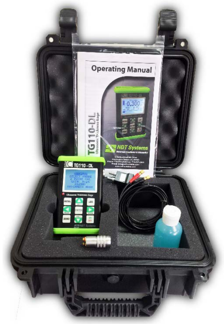
TG-110 Package including a probe